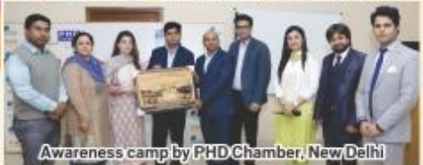
Awareness camp by PHD Chamber, New Delhi