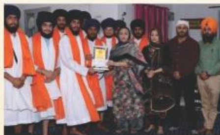
Celebrating 550 years of Guru Nanak Dev Ji at RIET Campus