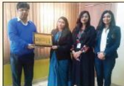
Expert Lecture on Latest Technologies