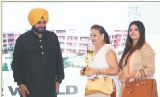
Best Edupreneur Award