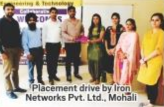
Placement drive by Iron Networks Pvt. Ltd., Mohali