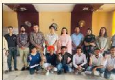
Students Got Placed in Mega Job Fest Held at RIET Campus 2021