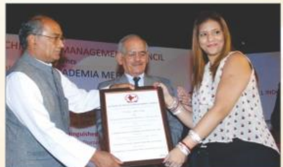
Life Time Achievement Award in Technical Education