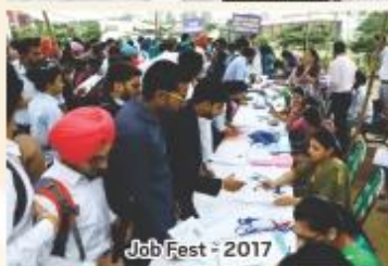
Job Fest - 2017