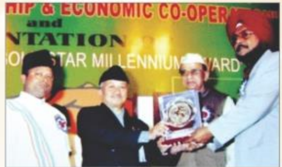
Interstate Goldstar Millennium Award