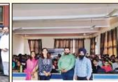
Workshop on Full Stack Web Development