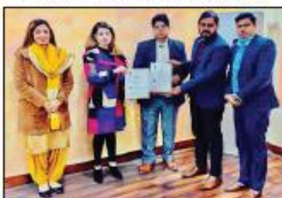
RIET, Phagwara & Microsoft Academy Partner Shape My Skill Pvt. Ltd Noida Sign MoU for Build an Microsoft Center at RIET Campus