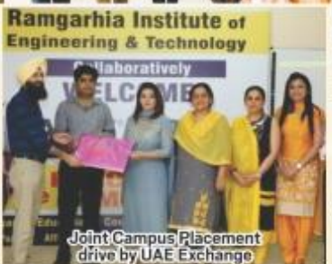
Joint Campus Placement drive by UAE Exchange