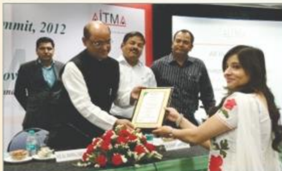
Punjab Gaurav Award