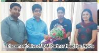
Placement drive of IBM Partner Headstar, Noida