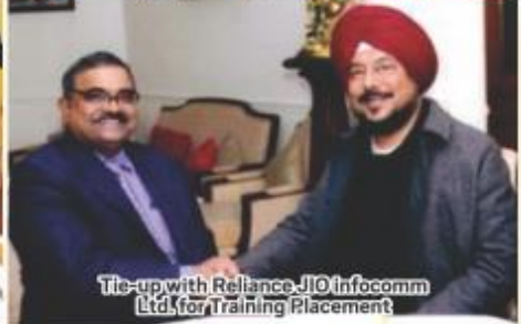
Tie-up with Reliance JIO Infocomm Ltd. for Training Placement