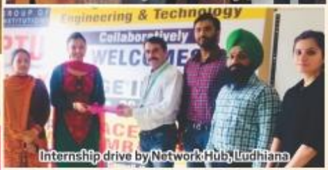
Internship drive by Network Hub, Ludhiana