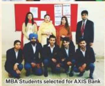
MBA Students selected for AXIS Bank