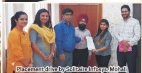
Placement drive by Solitaire Infosys, Mohali