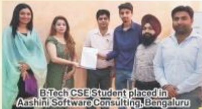
B-Tech CSE Student placed in Aashini Software Consulting, Bengaluru