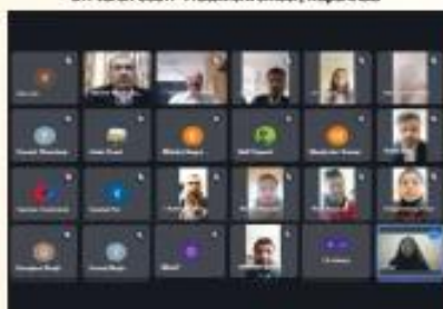
Online Awareness Program on One District One Product