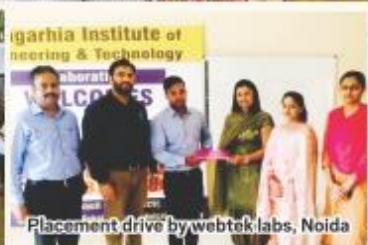
Placement drive by webtek labs, Noida