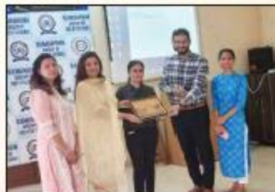
Workshop on Cyber Security and Ethical Hacking