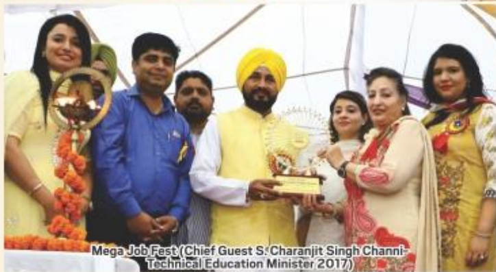
Mega Job Fest (Chief Guest S' Charanjit Singh Channi - Technical Education Minister 2017)