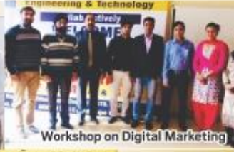
Workshop on Digital Marketing