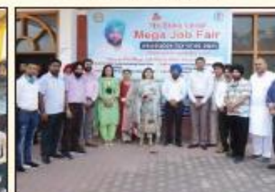
State Level Mega Job Fest 2021