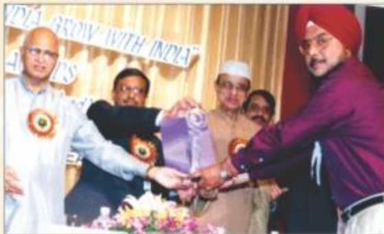
International Kohinoor Award