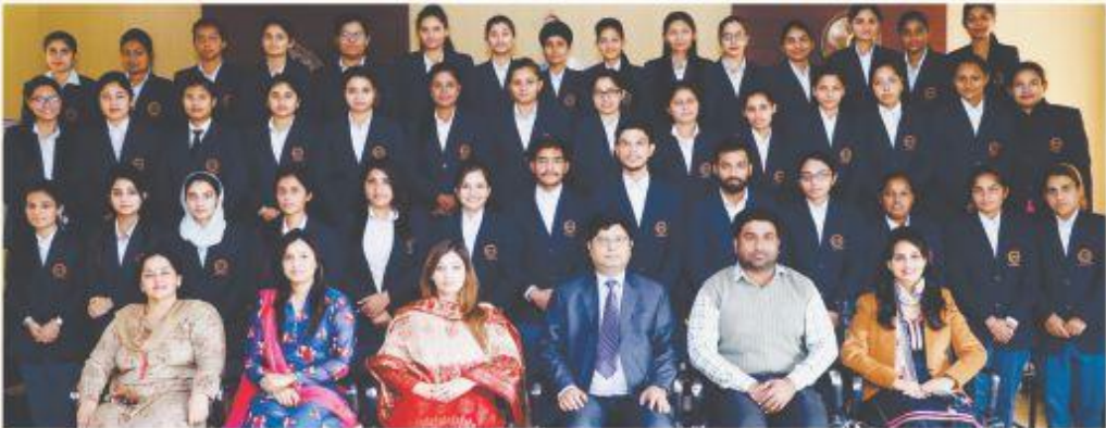
Ramgarhia Institute of Engineering & Technology's 42 Students got placed from Batch 2019 passing out in National & Multinational Companies