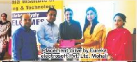
Placement drive by Eureka electrosoft Pvt. Ltd. Mohali