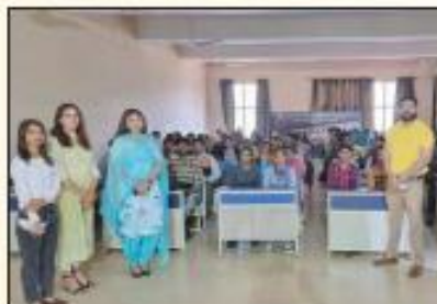
Seminar on District Employment Services and Free Govt Coaching