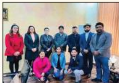
MBA, MCA Students Got Selected by Protolabz Eservices, Phagwara