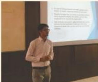
Presentation (PPC) Competition