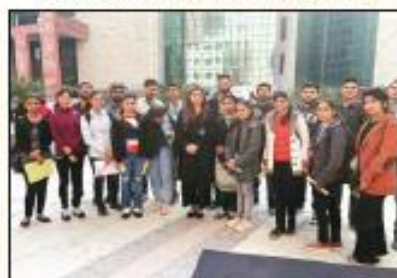
RIET Student Participated in Mega Job Fest at IKGPTU