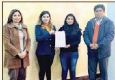
B.Tech ECE Student Placed in EKNOPS Network Pvt. Ltd, Bangalore