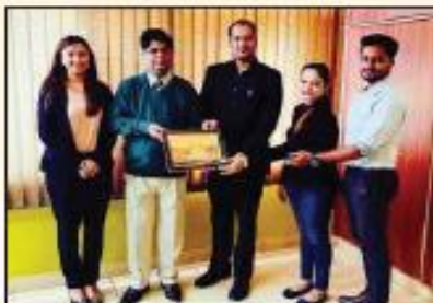
Entrepreneurship Awareness Camp Organised at RIET Campus