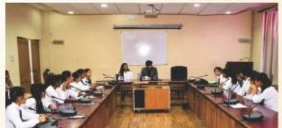
Placement Drive By Raps Technologies