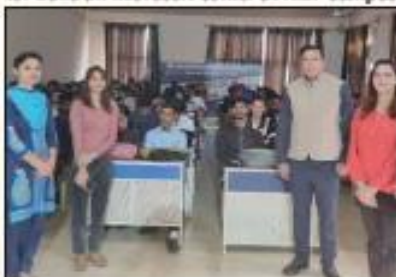
Seminar on Scope of AI & Machine Learning