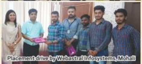
Placement drive by Webastral Infosystems, Mohali