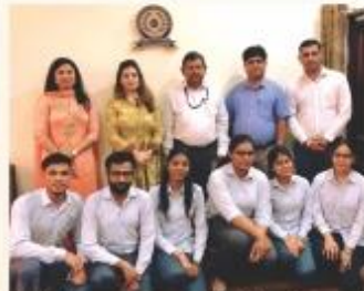
Placement Drive by SBI Life Insurance