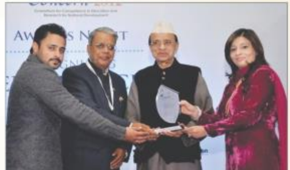
Excellence In Education Award