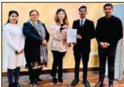
Hotel Management Student Placed in Double tree by Hilton, Ahmedabad